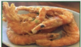
椒鹽蝦 Salt & Pepper Shrimp