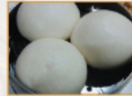
蒸奶黃包 Steamed Sweet Cream Bun