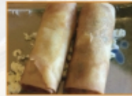
春卷 Egg Roll