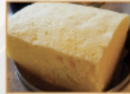
馬車糕 Sponge Cake