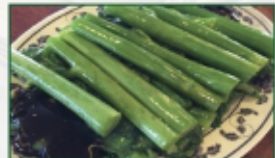
焗油芥蘭 Chinese Broccoli