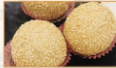
紅豆芝麻球 Red Bean Sesame Ball