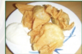
炸蝦角 Fried Shrimp Puff