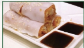
港式炸兩 Cruller Rice Noodle Roll