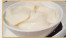
豆腐花 Sweet Tofu