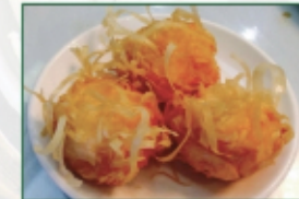
炸蝦球 Fried Shrimp Ball