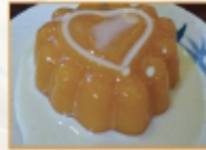
芒果布丁 Mango Pudding