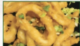
椒鹽魷魚 Squid w. Salt & Pepper