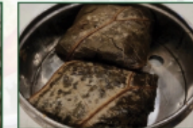
糯米雞 Sticky Rice in Lotus Leaf