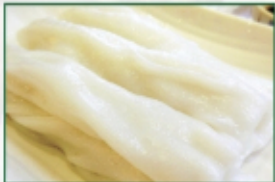
香滑白腸粉 Plain Rice Noodle