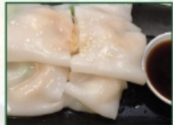
蝦腸粉 Shrimp Rice Noodle