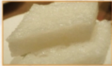
白糖糕 Sweet Rice Cake