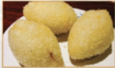
咸水角 Deep Fried Meat Ball