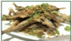
多春魚 Fried Smelt