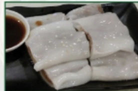
牛肉腸粉 Beef Rice Noodle