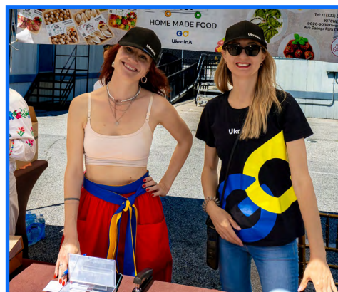
Ukrainian Festival “Pysanka” in Los Angeles Raises Critical Aid for Frontline Defenders