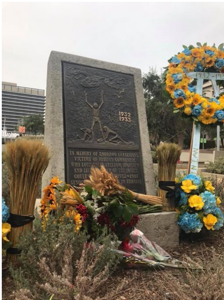
Holodomor Monument in LA's Grand Park