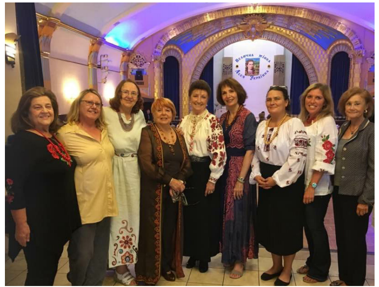
UAC Board & Volunteers

The stage goes dark, there is a pause as the narrators enter to a softly lit stage: Six years have passed since the death of Serhiy. A new and final chapter of Lesia's life and love begins - Lesia Ukrainka and Klement Kvitka. The audience is invited to watch a short film about the last years of Lesia's life in Georgia, where she and her husband, Klement, experienced suffering, poverty and loneliness in a foreign land,