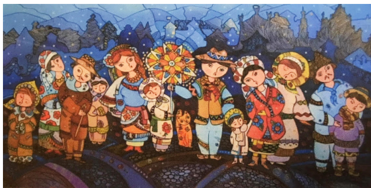
A Caroling We Go

We invite you to become an active participant in our arts organization! We thank all of our supporters for a successful 2017 and we are counting on your support in the future!