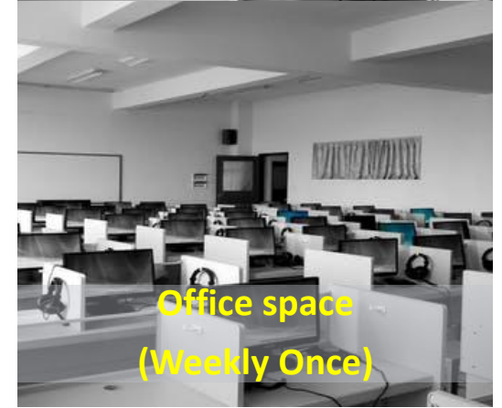
Office space (Weekly Once)