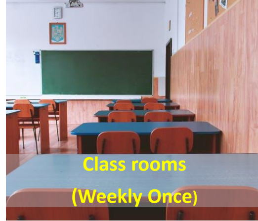
Class rooms (Weekly Once)