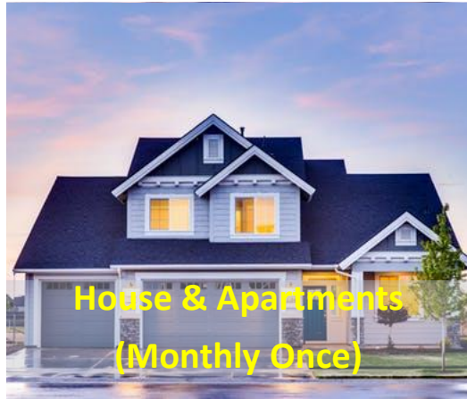
House & Apartments (Monthly Once)