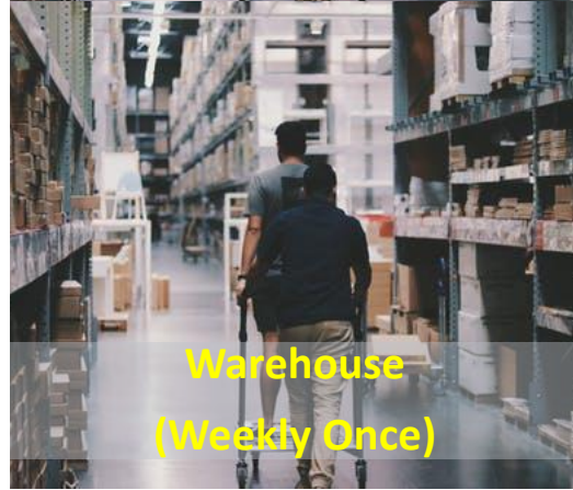
Warehouse (Weekly Once)