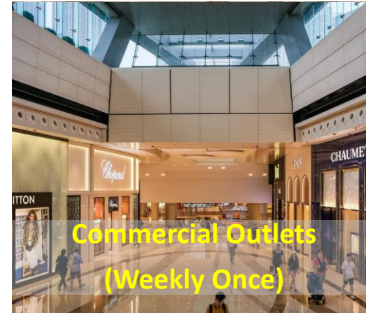
Commercial Outlets (Weekly Once)