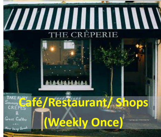
Café/Restaurant/ Shops (Weekly Once)