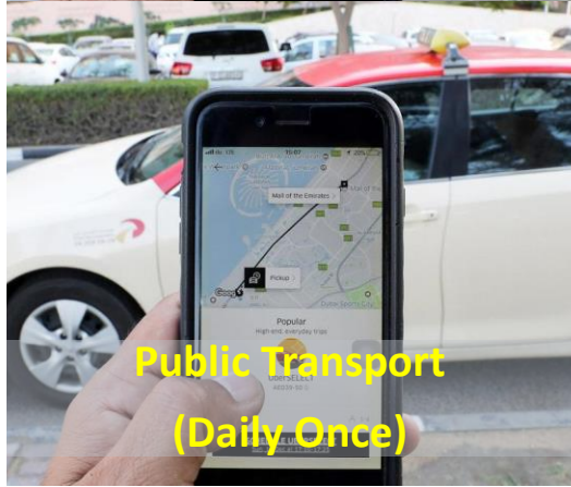
Public Transport (Daily Once)