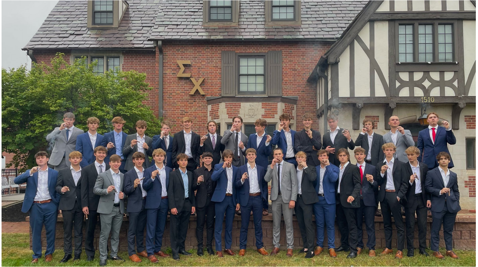
The newest fall class of '31, initiated the morning of September 23, 2023.