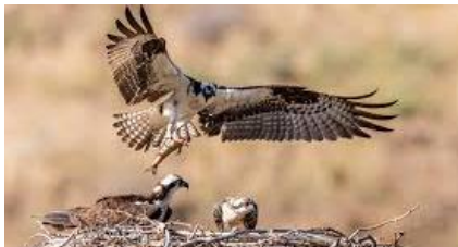
The osprey nest (located at the north end of the Lake District on top of the big black pole) has two eaglets that are starting to spread their wings. Bring your binoculars while you meander up the river and take a look.