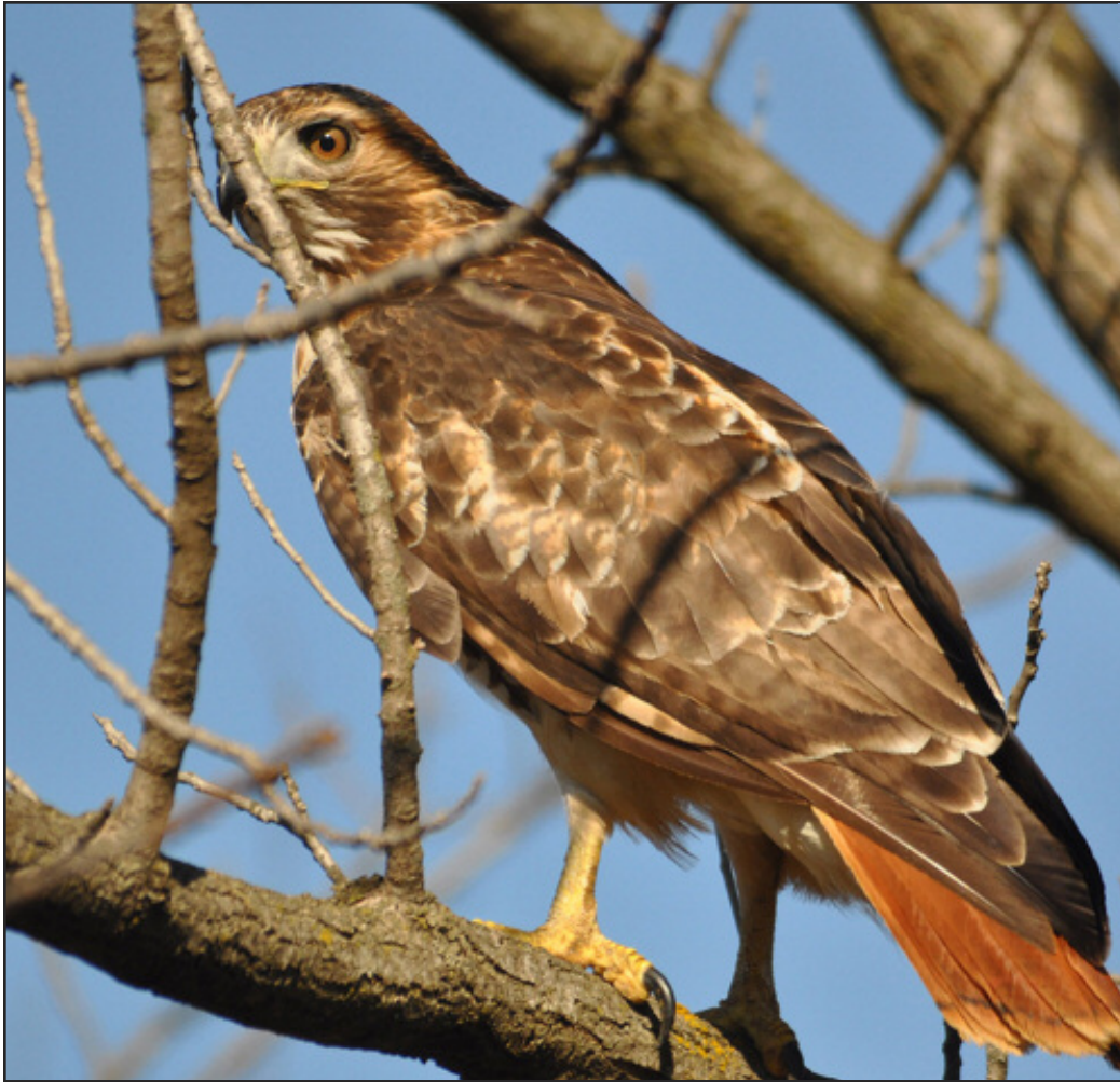
Mature hawk

Shown above is a mature Red-tailed Hawk. You'll most likely see Red-tailed Hawks soaring in wide circles high over a field. When flapping, their wingbeats are heavy. In high winds they may face into the wind and hover without flapping, eyes fixed on the ground. They attack in a slow, controlled dive with legs outstretched - much different from a falcon's stoop. Red-tailed hawks are one of the most common type of hawks found in North America.