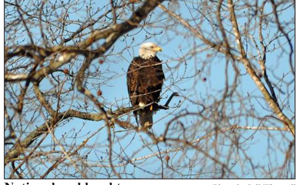
National and local treasure

The council approved the amended salary and wage ordinance. Changes were made in the prosecutor's office due to a new hire