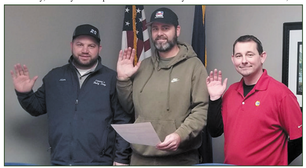
Sworn in

The full report can be found at www. in.gov/dcs/files/2019 Annual Report of Child Abuse and Neglect Fatalities_in_Indiana.pdf?utm_medium=email&utm_source=govdelivery