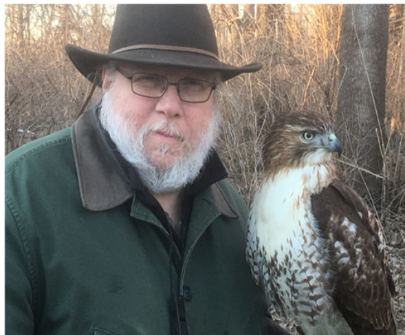
Bird of Prey

Raptors: hawks, owls, falcons, and their kin have long held our imagination. See what it's like to be hawk eyed or falcon fast by meeting these magnificent predators up close and hearing the stories of our shared history.