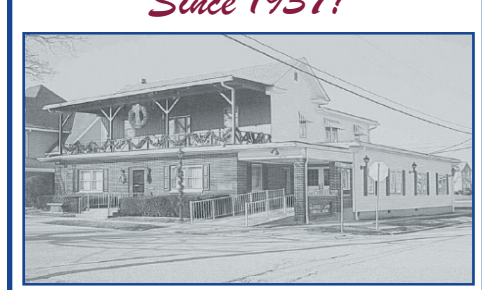
Ask us about the advantage of pre-arranging!