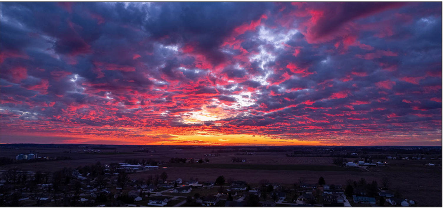
Red sky at night

The animal shelter took in 234 dogs and cats last year and provided spay and neuter for 877 dogs and cats, owned and shelter animals.