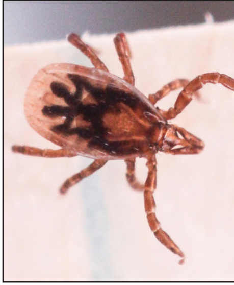
Deer ticks can transmit a number of illnesses including Lyme disease. (Andrew Nuss)

Researchers pinpointed some of the proteins that play key roles in the interactions between deer ticks and the bacterium that causes Lyme disease and