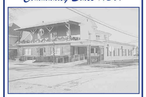
Stop by and see our newly renovated facility!