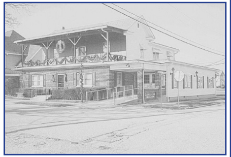
Stop by and see our newly renovated facility!