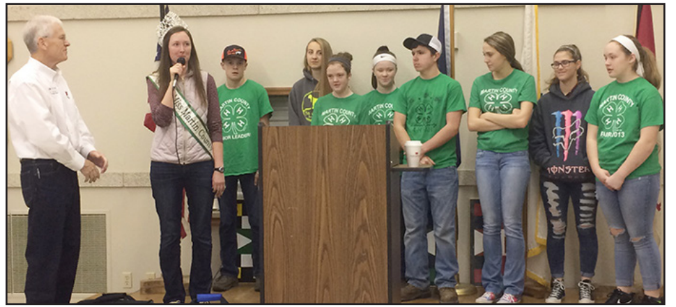
Martin County 4-H Junior Leaders started off the 24th Ag Day with the pledges as well as volunteered to serve over 300 people breakfast.