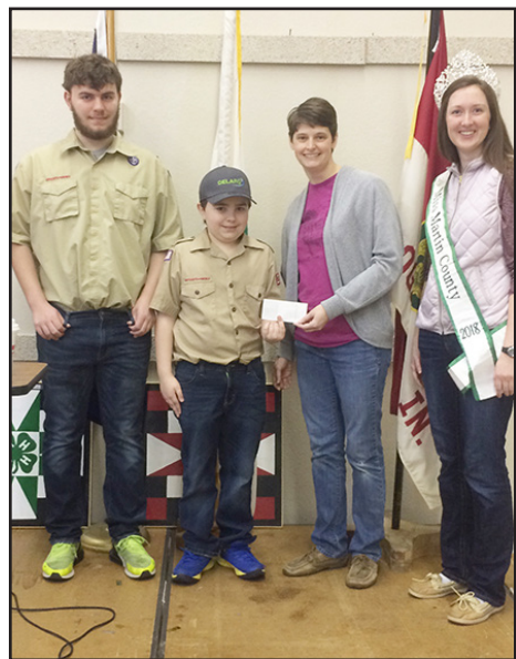
Martin County Boy Scouts presented the colors at the beginning of Ag Day. They also received a donation from the Ag Day Committee.