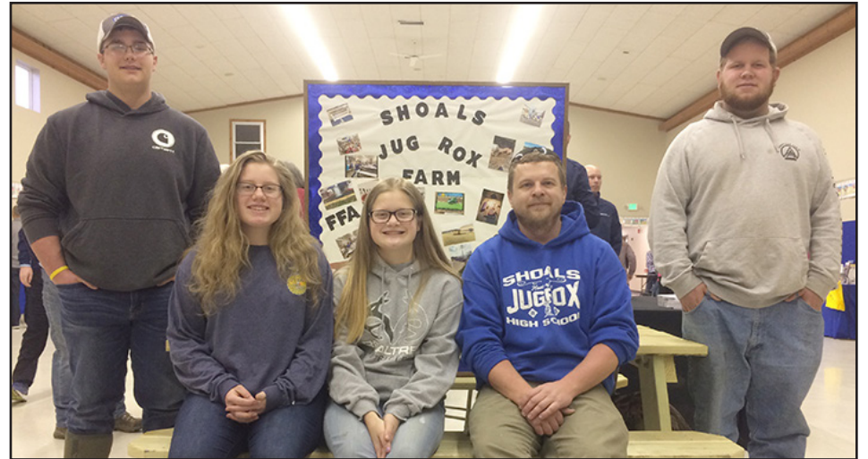
Shoals FFA provided pigs and chickens for the petting farm as well as displayed the picnic tables they have been making. The Ag Day Committee gave a donation toward their program.