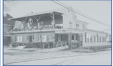
Ask us about the advantage of pre-arranging!