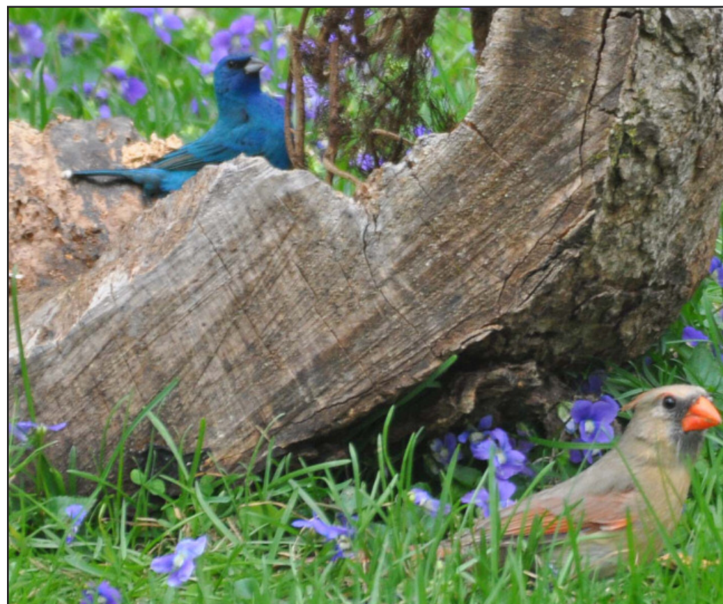
Indigo Bunting

Like all other blue birds, Indigo Buntings lack blue pigment. Their jewel-like color comes instead from microscopic structures in the feathers that refract and reflect blue light, much like the airborne particles that cause the sky to look blue.