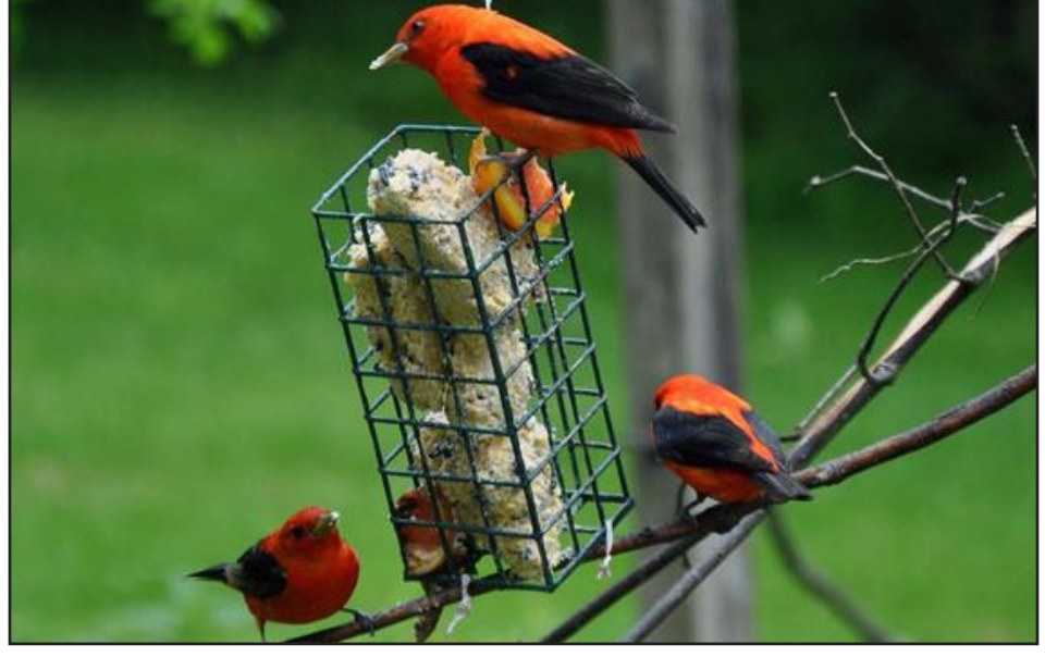
Scarlet Tanagers

Male Scarlet Tanagers are among the most blindingly gorgeous birds in an eastern forest in summer, with blood-red bodies set off by jet-black wings and tail. They're also one of the most frustratingly hard to find as they stay high in the forest canopy singing rich, burry songs.