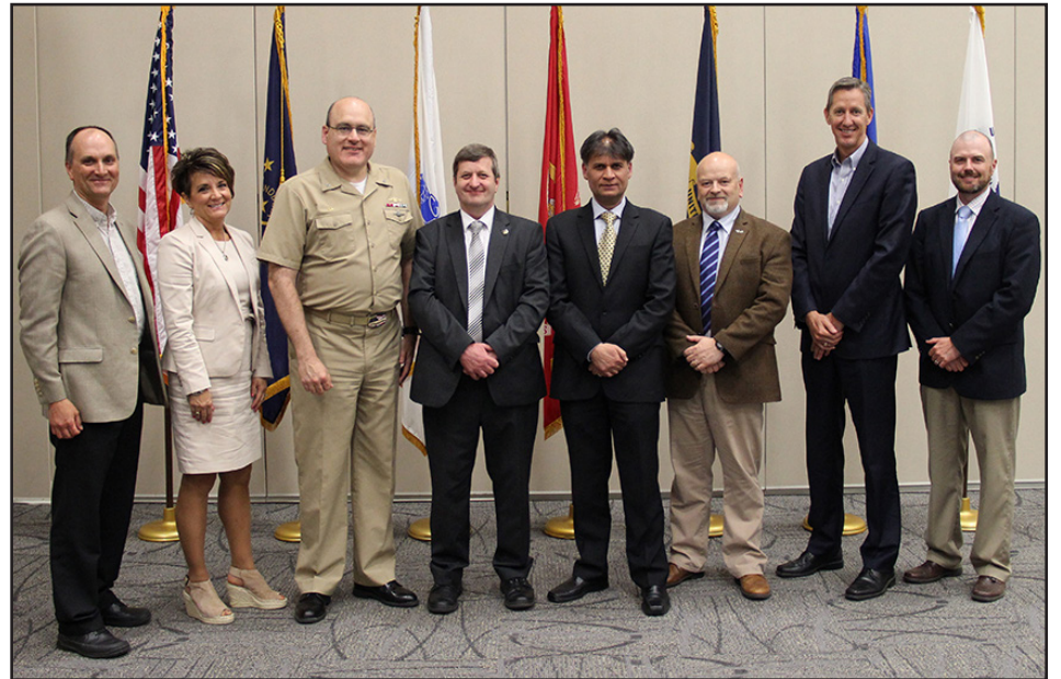
NSWC Crane formally announced its Expeditionary Warfare Systems Engineering Master's Degree program at a reception on Thursday, May 17th, at the WestGate Academy Conference and Training Center in Crane, Indiana.

The change in total nonfarm payroll employment for March was revised up from +135,000 to +155,000, and the change for April was revised down from +164,000 to +159,000. With these revisions, employment gains in March and April combined were 15,000 more than previously reported. (Monthly revisions result from additional reports received from businesses and government agencies since the last published estimates and from the recalculation of seasonal factors.) After revisions, job gains have averaged 179,000 over the last 3 months.