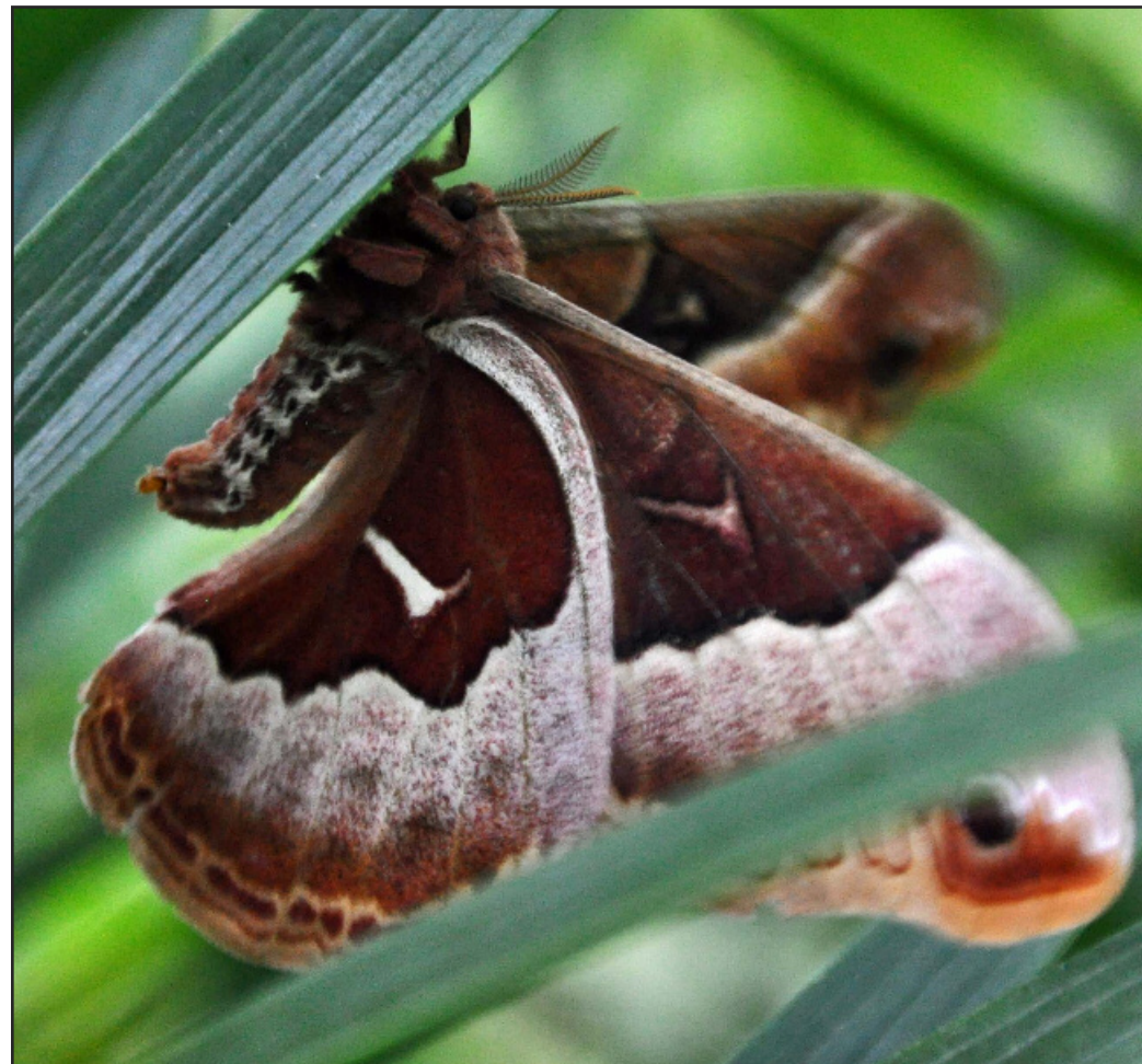
Mammoth moth

For more information, call (812) 849-3534 or email springmillstatepark@dnr.IN.gov .