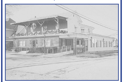
Stop by and see our newly renovated facility!