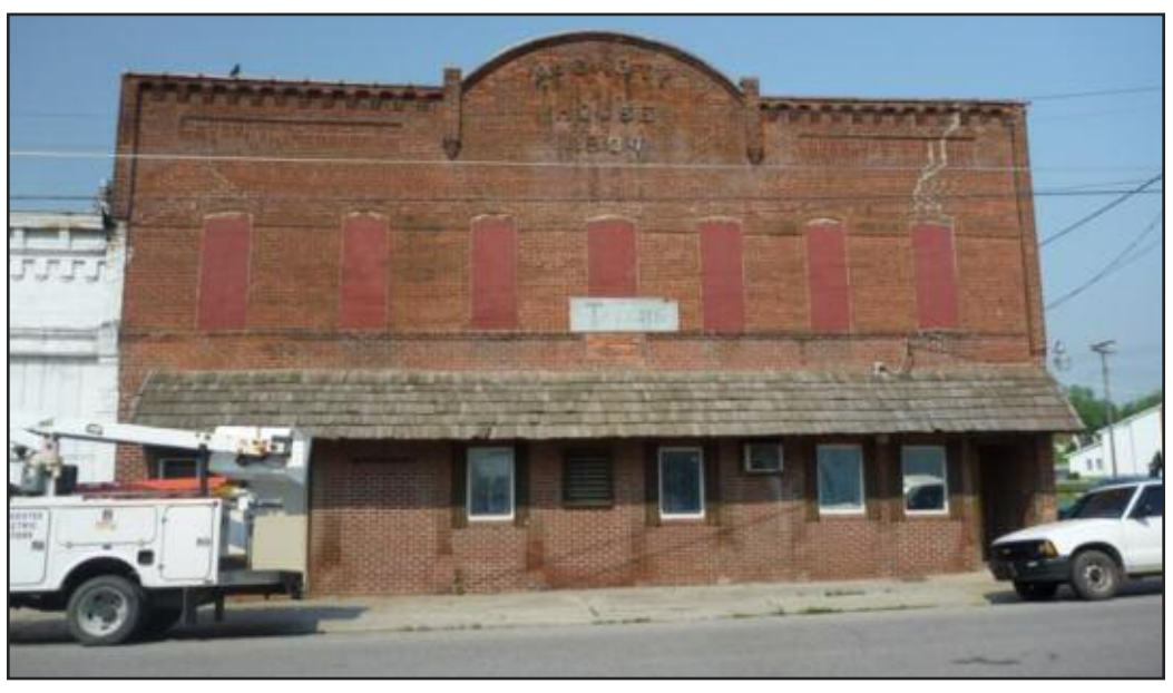
The McCarty House, most recently known as the Southside, located on Mill Street in Loogootee was built in 1905. The building was originally constructed as a hotel.