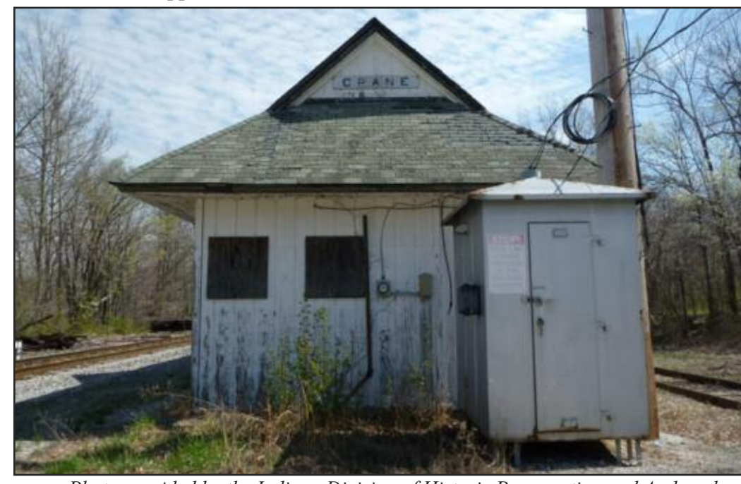
The Crane Depot, located north of the intersection of Depot Street and 3rd Road, was built in 1915. According to neighbors, the depot is planned to be demolished. The depot is the only one surviving in the county and is listed as "notable" on the historical survey.