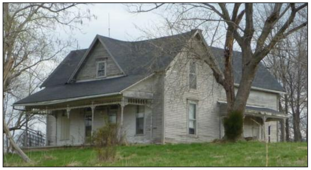
The house above located on a farmstead on the east side of Sod Run Road was built in 1880.