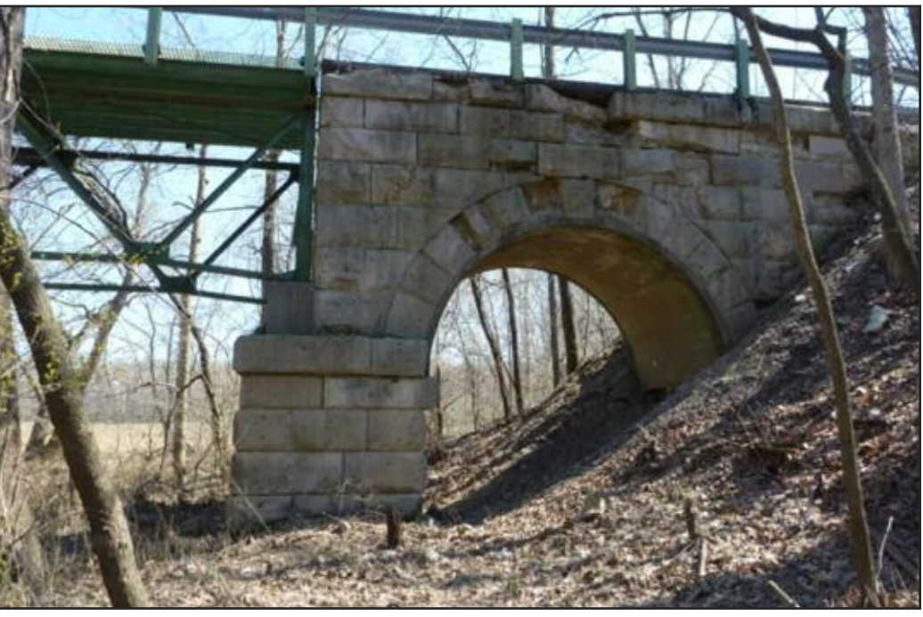
Martin County Bridge #58, located on Brickyard Road over Boggs Creek just north of Highway 50, circa 1890/1910, has a Warren deck that was built in about 1910 with limestone arch supports that were built in about 1890.