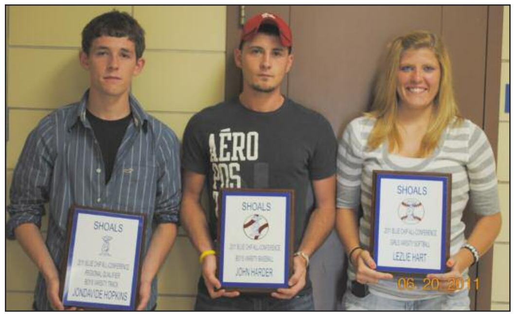
Blue Chip All-Conference