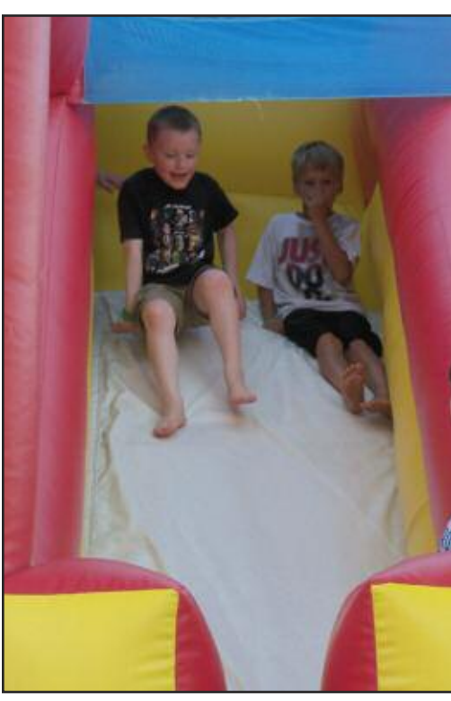
The SummerFest once again offered inflatables for the younger population.