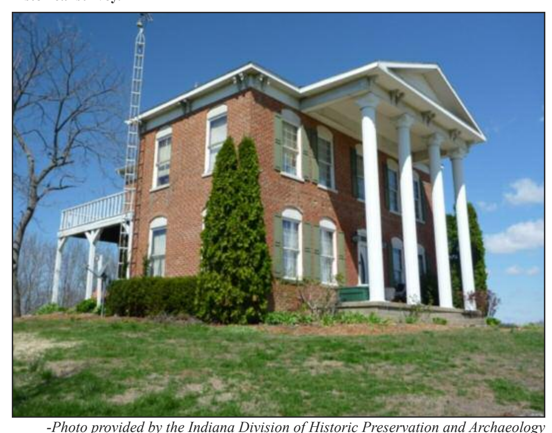
The Starlin Sims House, located on Hwy. 231 in Perry Township was built around 1850.