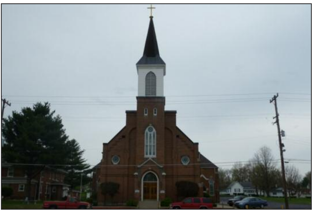
St. John Catholic Church was organized in 1857 and the first church was built in 1860. The current church was built in 1880 and is located on Church Street in Loogootee.