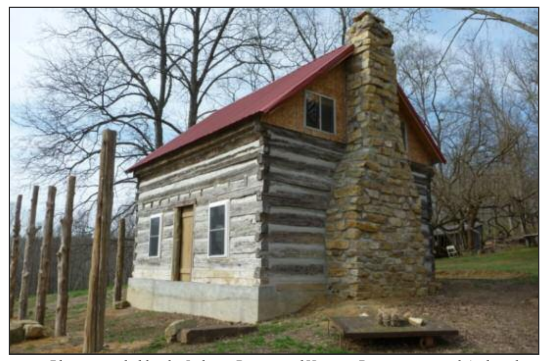
The house above, located on the west side of Love Cemetery Road, north of Wildman Road and west of Crane School was built in 1840. The home is listed in excellent condition on the survey. The house was moved from somewhere past the end of Bussinger Lane and is severely altered from it's original state. The house has recently been restored and the interior is unfinished.