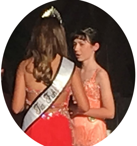
2016 Summerfest Junior Miss.