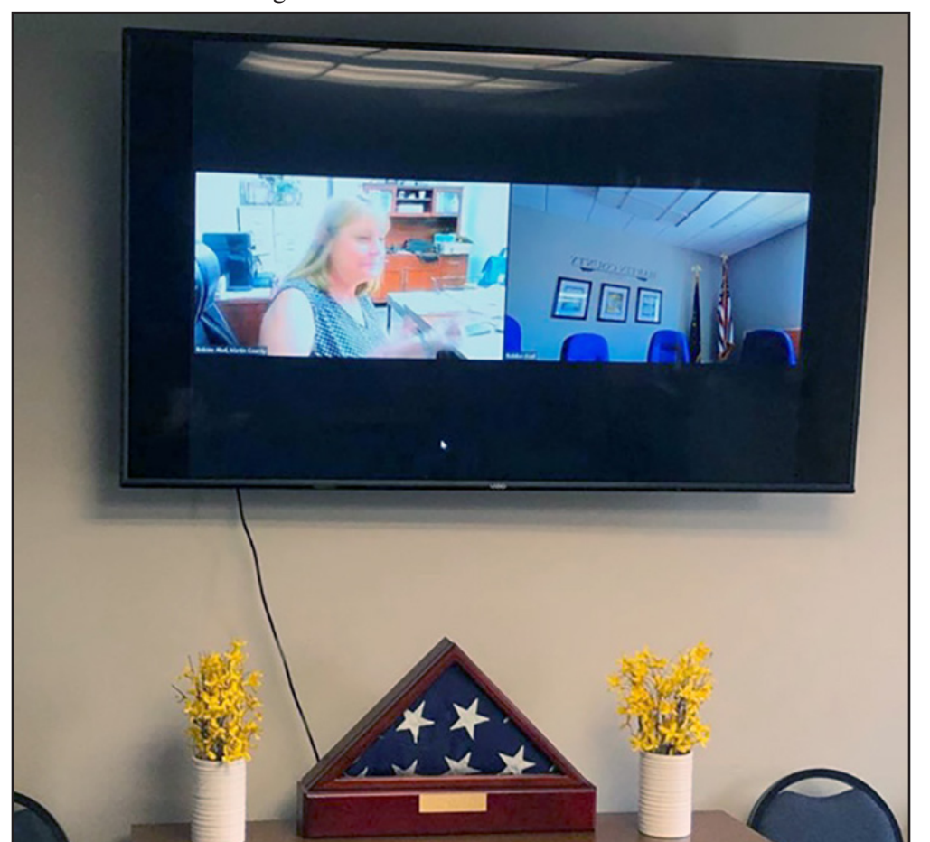
Courthouse tech upgrade

10:15 p.m. - Sergeant Reed requested next on-call tow company for an abandoned vehicle east of Shoals.