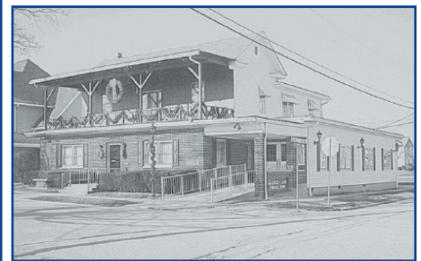
Ask us about the advantage of pre-arranging!