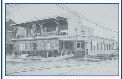
Ask us about the advantage of pre-arranging!