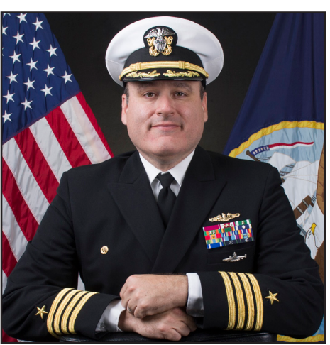
Commanding Officer, NSWC Crane Division