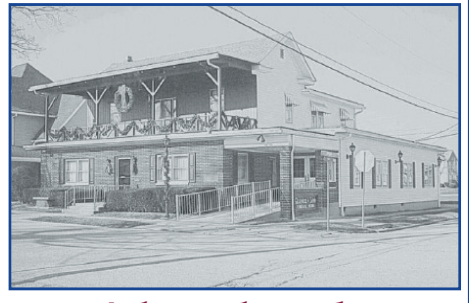
Ask us about the advantage of pre-arranging!