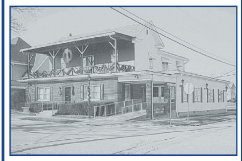
Ask us about the advantage of pre-arranging!