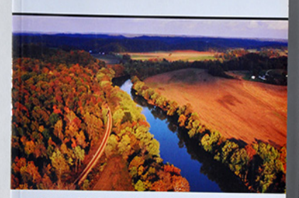
Good Morning Martin County

7:40 p.m. - Received a request for an ambulance in Loogootee. Loogootee Fire and Martin County Ambulance responded. The subject was transported