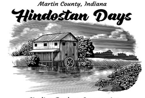
Circling Back to Community

Shoals Community School Corporation - $2,000 to supply Jug Rox Robotics with parts, equipment, and hardware for their robotics program.