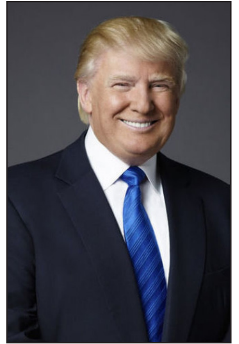
DONALD J. TRUMP

in 1998, winning by 55 percent to 45 percent. In his second term, he concentrated on the issue of school voucher reforms, as well as campaigning for marijuana decriminalization and opposition to the War on Drugs. Term-limited, Johnson could not run for re-election at the end of his second term. As a fitness enthusiast, Johnson has taken part in several Ironman Triathlons, and he climbed Mount Everest in May