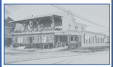
Ask us about the advantage of pre-arranging!