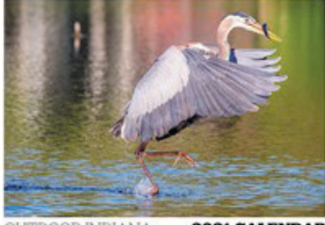
OUTDOOR INDIANA 2021 CALENDAR

Calendar photo highlights include the magazine's cover shot of a wintry scene