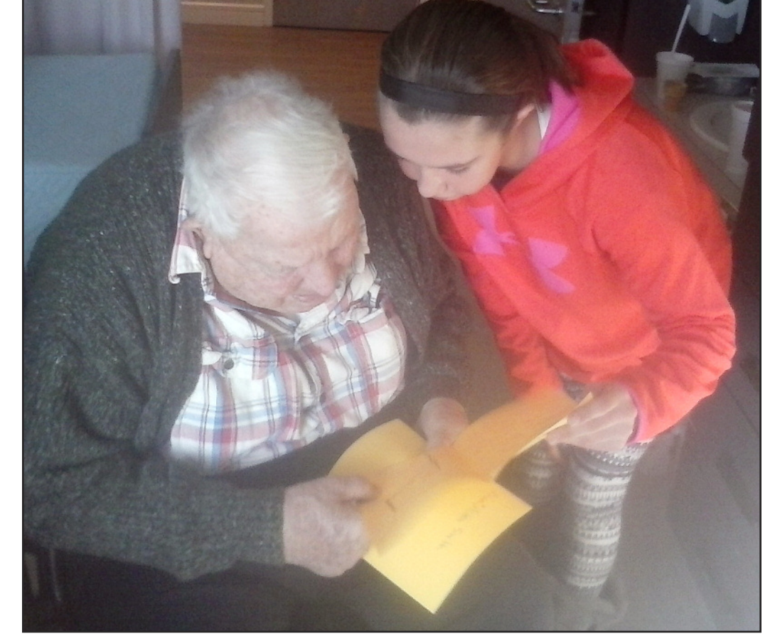
We salute you!