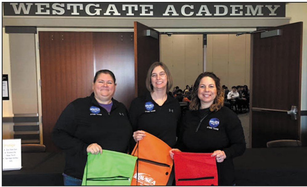
The Naval Surface Warfare Center, Crane Division (NSWC Crane) K-12 Science, Technology, Engineering, and Math (STEM) program was honored with a regional innovation award on October 13, 2020.