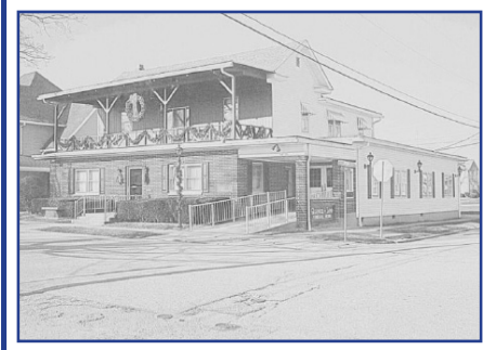
Stop by and see our newly renovated facility!