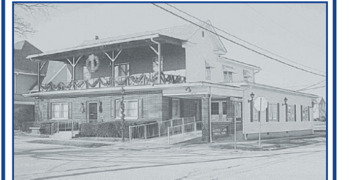
Ask us about the advantage of pre-arranging!