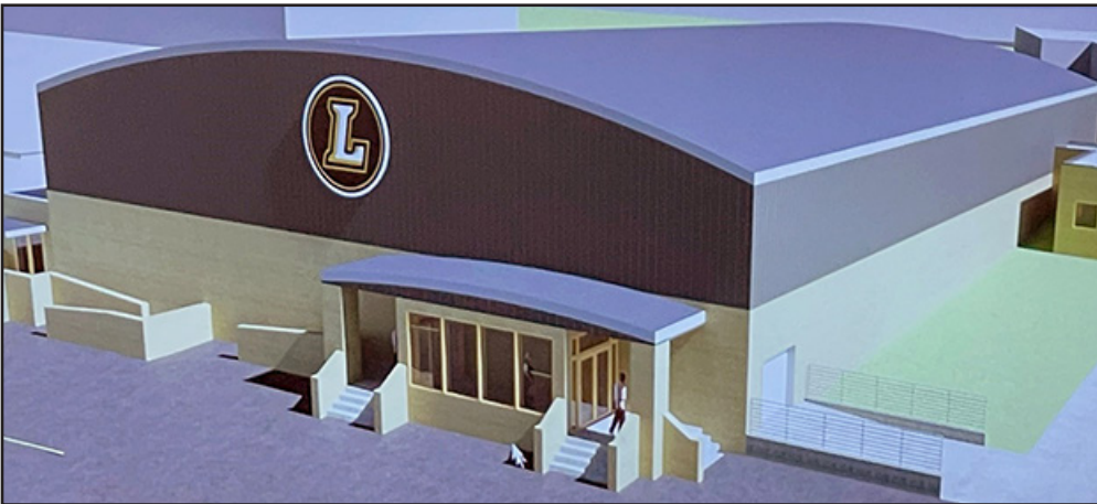
Above is a rendering of the new 22,087-square foot activities center Loogootee School plans to build, starting next year. The photo below is the new campus layout.