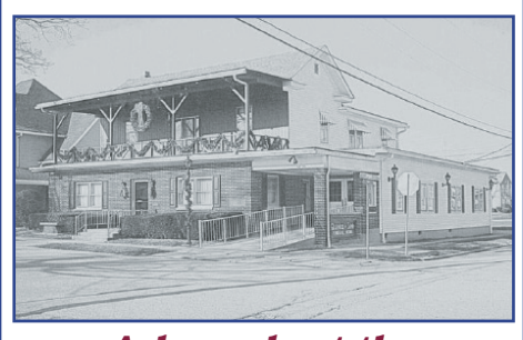
Ask us about the advantage of pre-arranging!