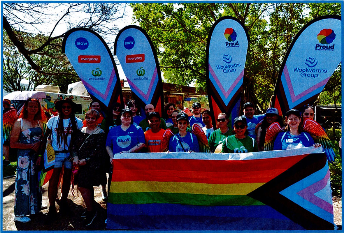
Woolworths – Proud sponsors of Darwin Pride 2022 and 2023