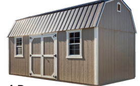
Side Lofted Barn