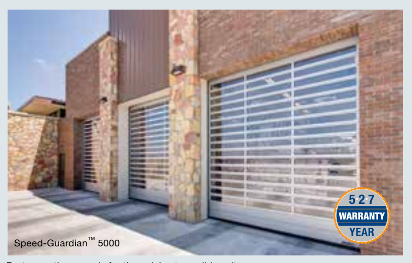
Fast operating speeds for the quickest possible exit

Optional colors are available on both the Speed-Guardian<sup>™</sup> and Steel Ranger<sup>™</sup> models (Any RAL color). A built-in guide track light curtain provides an invisible barrier of protection for pedestrians and vehicles.