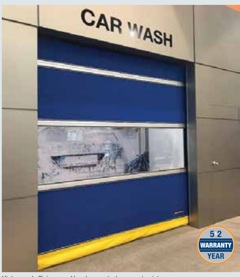
High-speed efficiency and breakaway at a lower cost point

See product-specific brochures for additional information on models. Technical specifications are available on model Product Data Sheets.