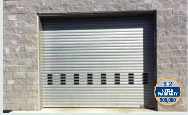
Fast operating speeds control energy costs and prevent unwanted entry