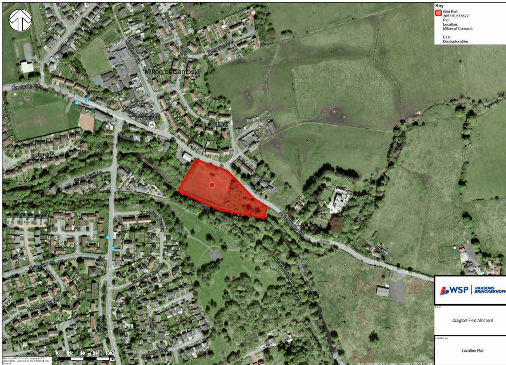
Figure 6-5-1 Site Location Plan