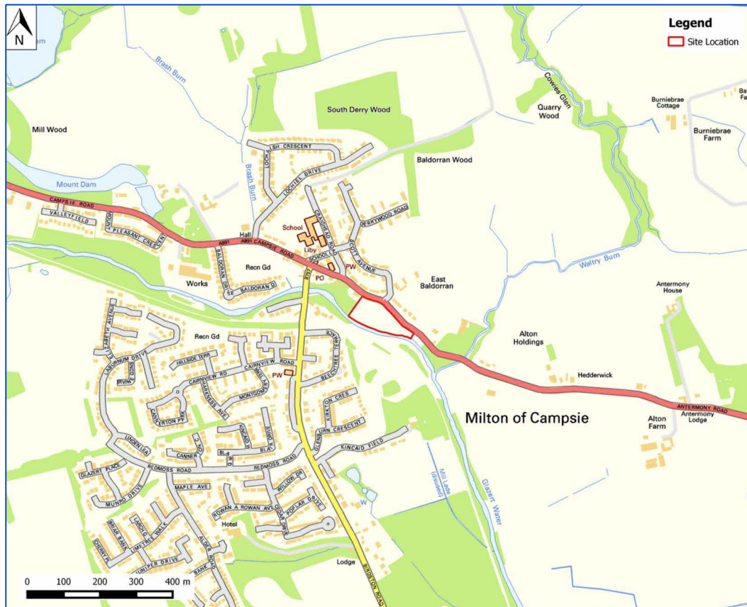
Figure 3-1 Site location