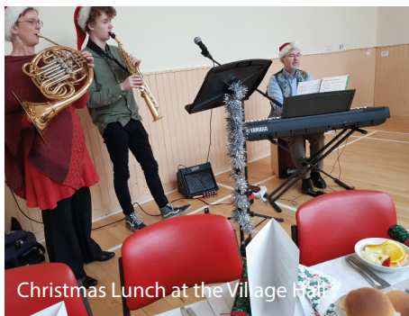
Christmas Lunch at the Village Hall