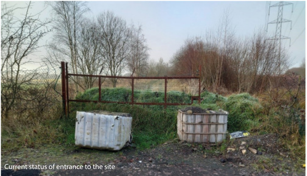
Current status of entrance to the site