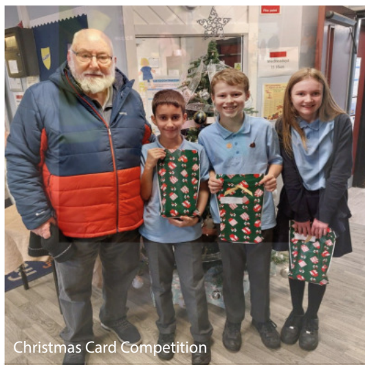
Christmas Card Competition

50 people attended the festive meal provided by the Community Council on 22nd December 2023 for all residents of Milton of Campsie and Birdston who would be spending Christmas alone. Seasonal music was played and sung by the Kemp family, greatly appreciated by the diners.