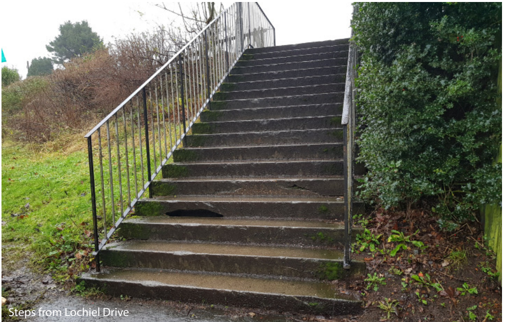
Steps from Lochiel Drive

Parents who take children to school by car have started using the route which involves walking from Lochiel Drive to Craighead Road. The congestion at times of drop-off and collection has therefore moved from Craighead Road to Lochiel Drive. To enable traffic to pass in both directions, people park on the pavement. This will soon be illegal, which will exacerbate the problem unless Lochiel Drive is made one-way (using the loop with Lochalsh Crescent). Unfortunately the stairs in the pathway between Lochiel Drive and Craighead Road are falling apart, making them less safe. As one resident said "it looks as if EDC designed this experiment to fail!"