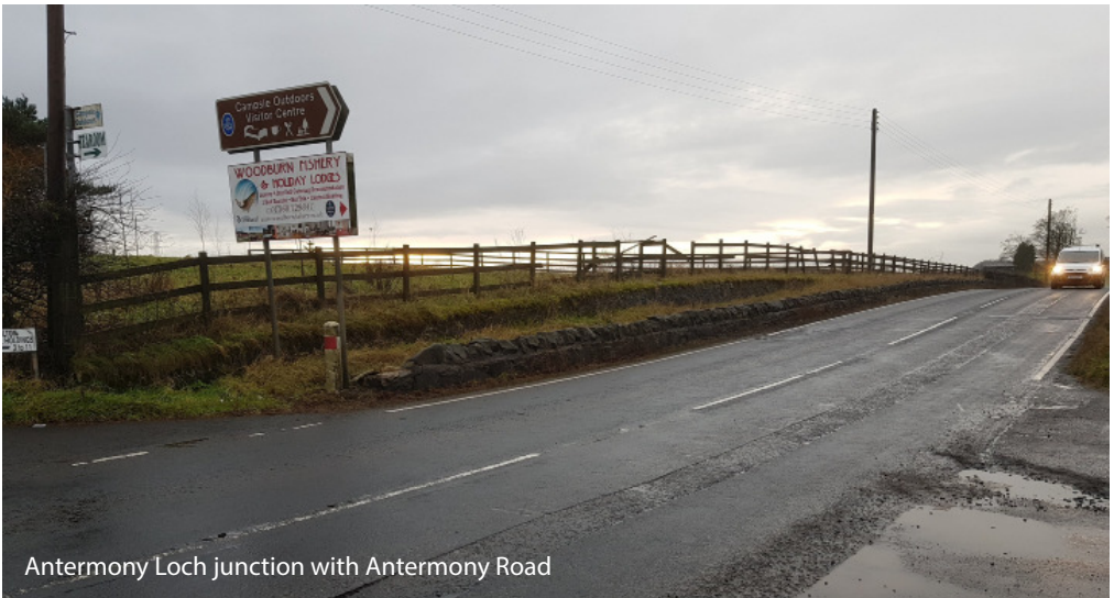
Antermoney Loch junction with Antermoney Road

The road to Antermoney Loch is the route of one of East Dunbartonshire's Core Paths, but access without a vehicle is difficult because of the lack of footpath along parts of Antermoney Road. This also makes it difficult for residents around Alton and Lochmill to access public transport.