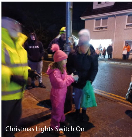
Christmas Lights Switch On