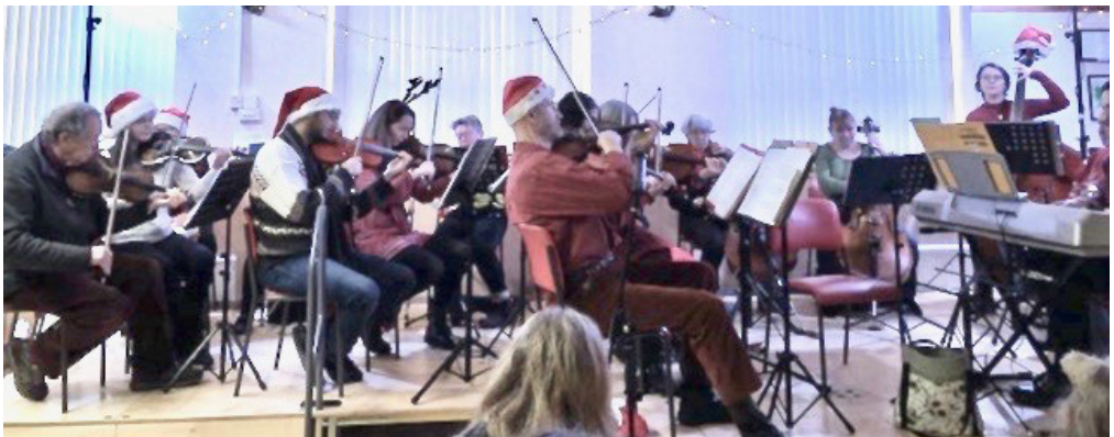
Winterfest - St Vincent Baroque Players

A longer version of this article is available at https://miltonofcampsiecc.co.uk/news/