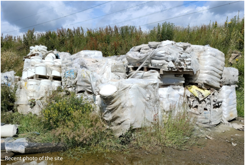
Recent photo of the site

The meeting was interactive and locals had lots of questions and suggestions that have been gratefully noted by BRG. It is important that the community engage in the process of CRTB for it to be successful. Following the speakers' interactive activity, stations were set up to allow residents to contribute to the process of making the coup safe. BRG launched its petition for community support which is an essential,