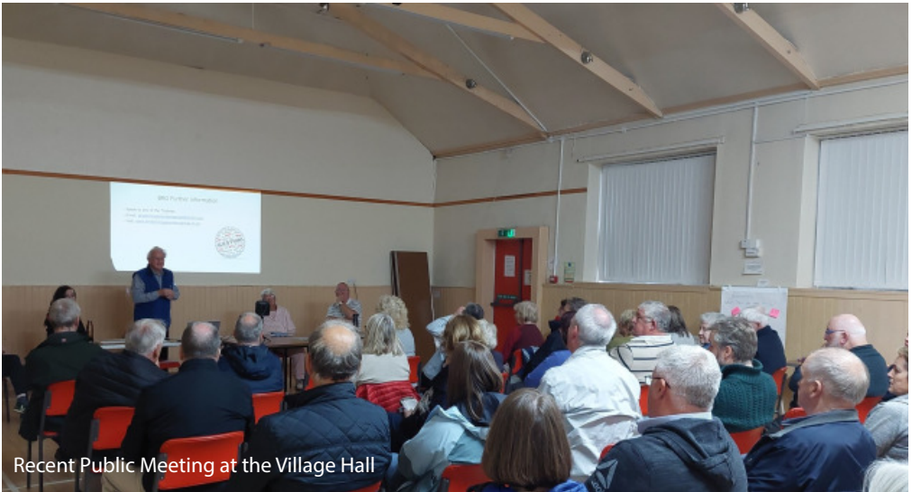
Recent Public Meeting at the Village Hall

BRG is a Scottish Charitable Incorporated Organisation (SC052301).