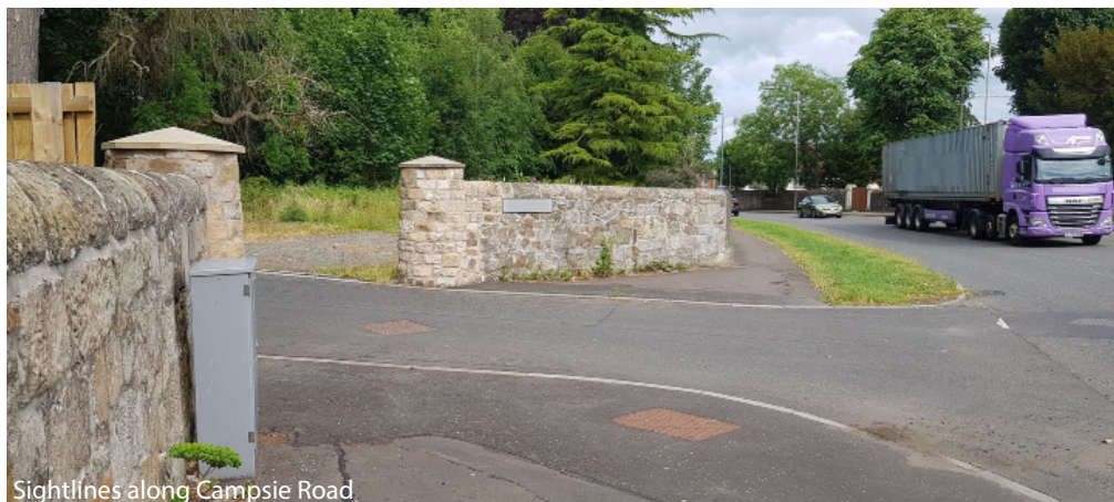
Sightlines along Campsie Road

It is important that developers adhere to the conditions when planning consent is given for access to public roads. The Community Council is vigilant to respond if planning consent is breached in ways that affect safety, especially of people walking on the roadside footpaths. Also, plants should not be allowed to grow into thoroughfares to the extent that visibility is obscured.