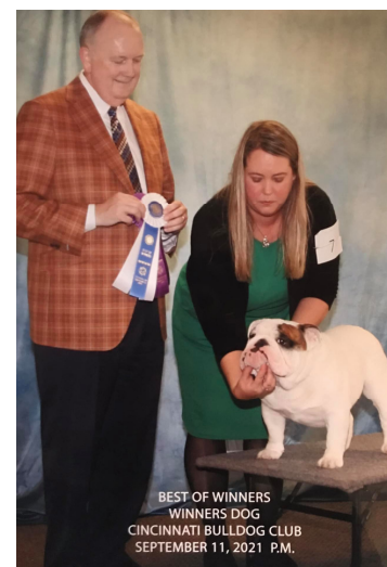
BEST OF WINNERS WINNERS DOG CINCINNATI BULLDOG CLUB SEPTEMBER 11, 2021 P.M.