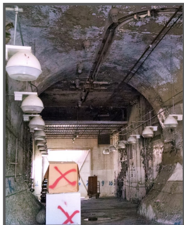
Lead-based paint stabilization before (above) and after (right) abatement.

Providing the highest quality in asbestos abatement, lead-based paint abatement, mold remediation, and selective demolition services to government, military, commercial and residential clients since 1993.